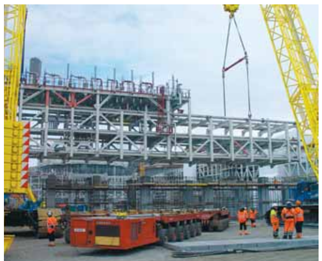
MODULE LIFTING BY MEANS OF 2 x 600 TONS CRANES