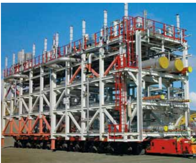
TRANSPORT WITH SPMT'S