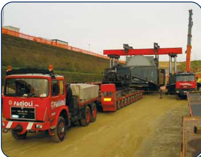
Client: TOSHIBA Ltd, Japan