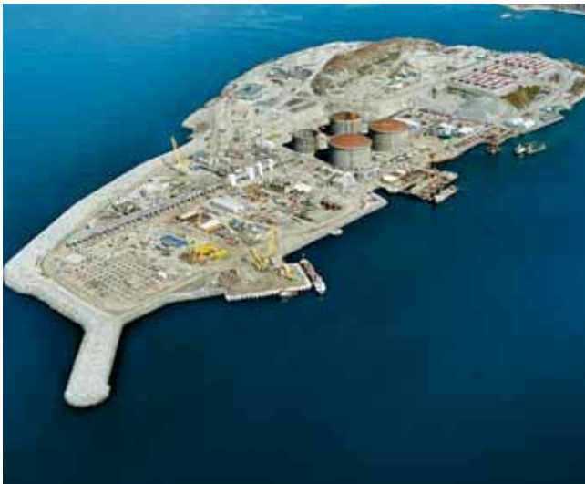
Client: STATOIL, Norway MELKOYA ISLAND: LNG PLANT

HAMMERFEST PROJECT (2004/2005): Transport and installation of abt. 100 heavy modules up to 3.500 tons (tot. Approx. 25.000 t) by means of Spmt's, Strand Jacks, Cranes for LNG plant in northern Norway