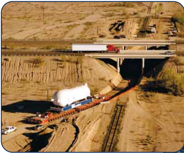
TRANSPORT OF 2 STEAM GENERATORS X 750 TONS FROM MILAN TO NUCLEAR POWER PLANT ARIZONA USA, 2003