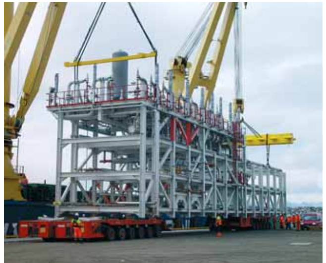
UNLOADING BY MEANS OF 400 TONS HEAVY LIFT VESSEL CRANES